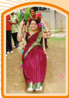
Where joy knew no boundaries....