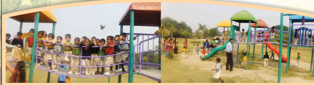
Light moments when children were in their true colours during excursion