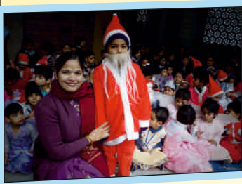
'Santa' among the students on christmas....