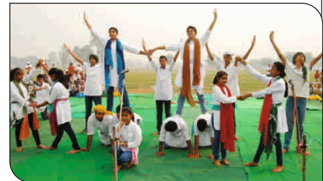
Students of SRS presenting Nukkad Natak at Bhim Stadium, Bhiwani