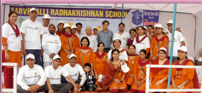
SRS staff members with the dignitaries present on the day