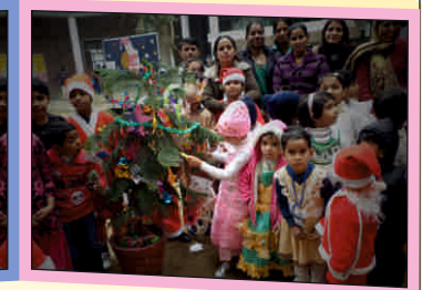
Blooming dales on the festival - Christmas