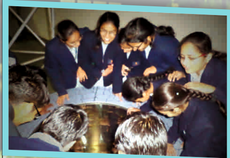
Let me also see...