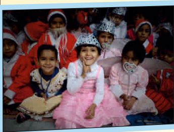
Innocence with happiness....