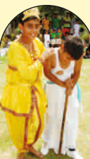
Krishna in his vibrant colours