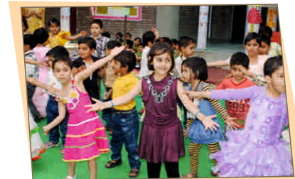
I love my INDIA...