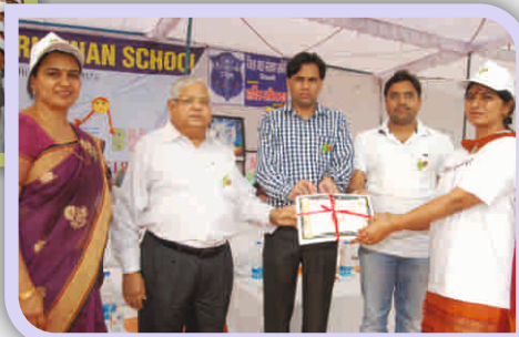
The guests giving away participation certificates to the team in-charge