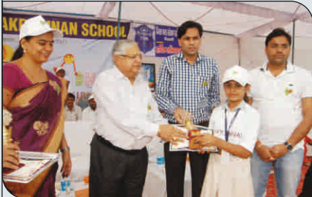
Giving away prizes for Inter-School events