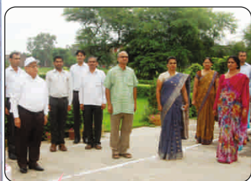
The proud moments - when our National Flag was unfurled by worthy Chief Guest.