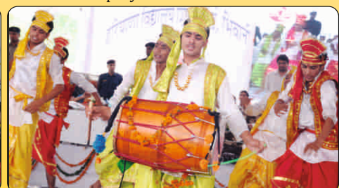
SRS rocks when SRS boys performed Bhangra on Punjabi beats