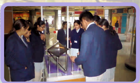
Let us peep into the world beyond, the wonderful world of science.