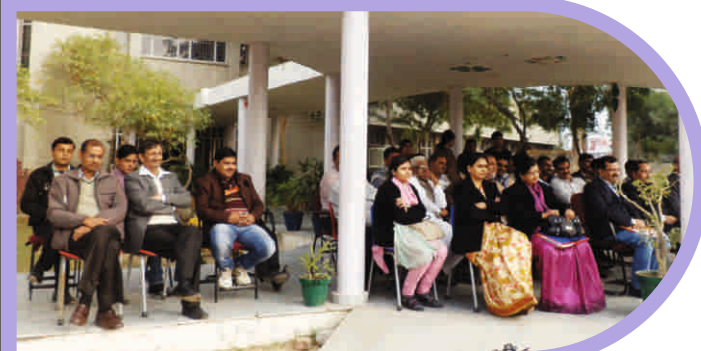
Representative from National University of Educational Planning & Administration. (NUEPA)