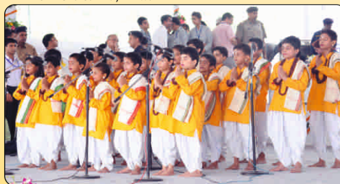
Students of SRS enchanting shlokas to praise Goddess of knowledge, Maa Saraswati