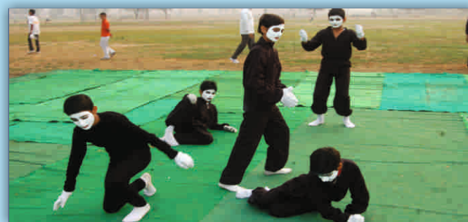
Arousing thought of masses via mime on the occasion of "Putrivati Bhava"