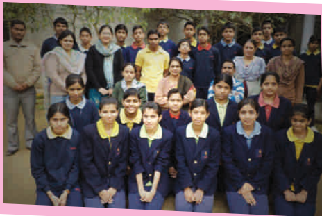
Students with the staff members on showing excellent performance in Board Examination