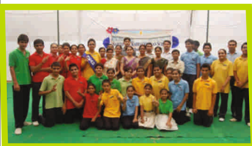
Together with the Chief Guest