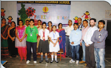
Winners of Inter-School Speech Competition