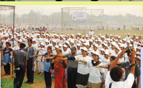
Participants for "Run to Save the Girl Child" taking oath to save & empower womanhood