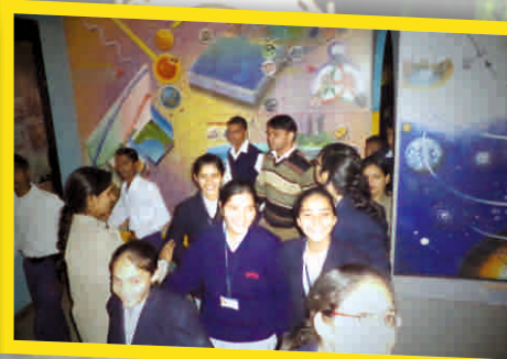
Wow ! Wonderful...