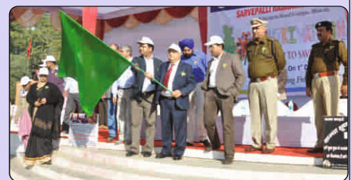
Awareing people at Narnaul to "Save The Girl Child" under the drive "Putrivati Bhava"