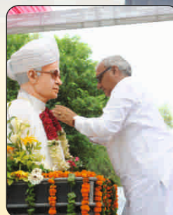
Mr. Bhupender Singh Hooda garlanding the bust of Dr. Sarvepalli Radha Krishnan