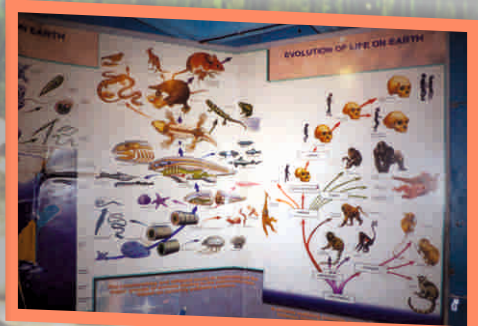
We came to know more about these miniatures on our visit to National Science Museum, New Delhi