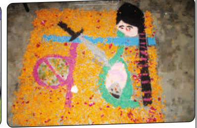
Carved feelings on Canvas during Inter-School events held during the first phase of "Putrivati Bhava"