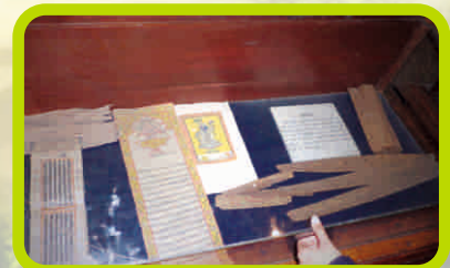
Pleasure with Knowledge