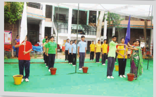
KAC shouldering responsibility to the Student Council

Student Council swearing in oath for their duties