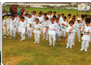
Tiny tots saluting the glory of the mother land.