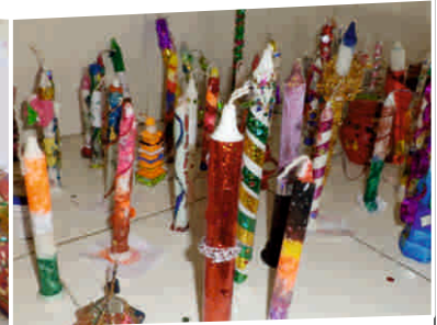
Candles and diyas decorated by the students of SRS