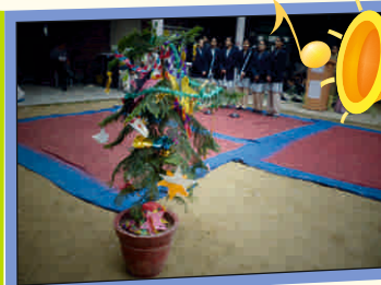
The pious Christmas Tree decorated by the students.