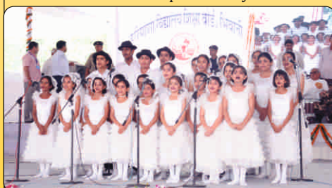
SRSians welcomed the present esteemed guests by singing welcome song