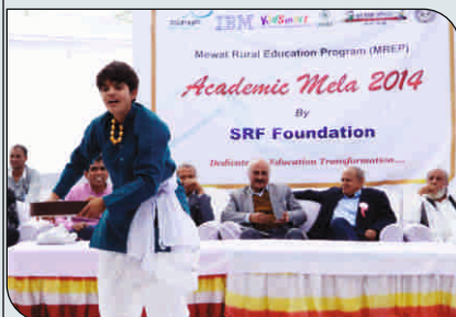
SRS team giving its presentation at Mewat