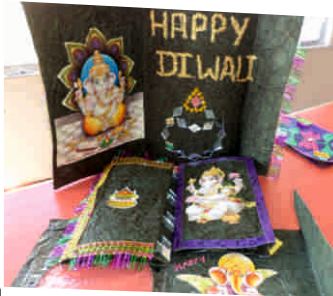
Wishing Happy Diwali