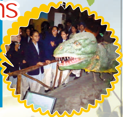
Students of Class XII at National Science Museum, New Delhi