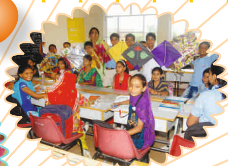
Kites ready to scale heights on Teej