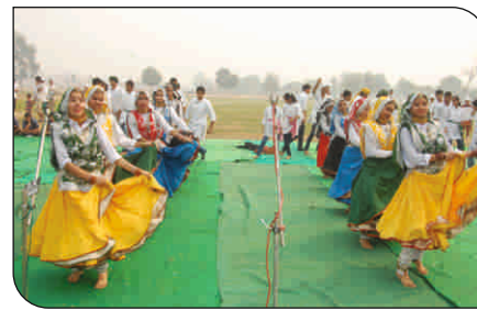
Mahare Ghar Mein Khushiya Chhai Jaayi Hein Mahare Ladli....