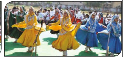
Grand Nukkad Natak - The Street Play - arousing pious emotions for daughters