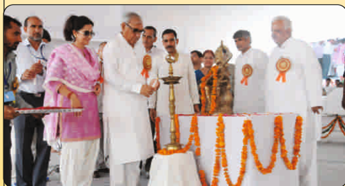
Chief Guest of the event lighting the lamp on the auspicious day