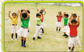
Students enjoying their day by flying kites and making dance movements....