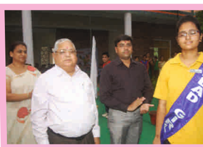
Head Girl and Head Boy being honoured with sashets