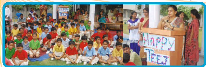
The Principal showering blessings on the day