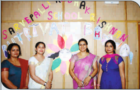
During press conference