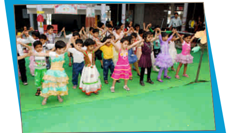
The air clad in saffron colour of Martyrdom - Mera Rang De Basanti Chola...