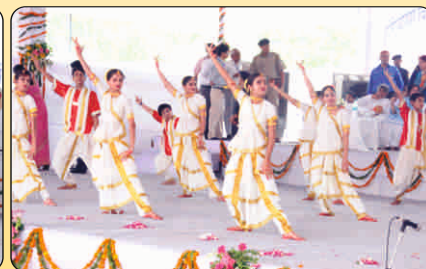
The celebration began with offering prayers to Lord Ganesha