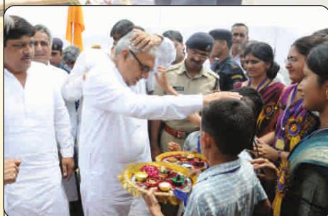
Students of SRS welcoming worthy C.M. Sir, Mr. Bhupender Singh Hooda

When honourable Chief Minister of Haryana, Mr. Bhupender Singh Hooda, blessed the land of SRS on Annual Day