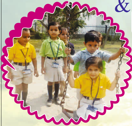
Tiny Tots at HUDA Park Bhiwani, learning lessons of life