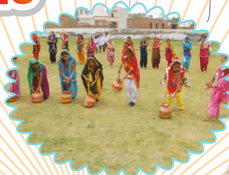
The day dipped in Colours of Teej