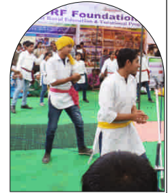
Nukkad natak at Mewat