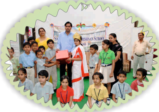
Receiving encouragement for the efforts