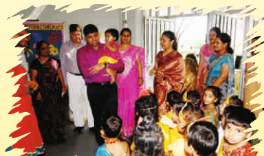
Interaction with little hearts