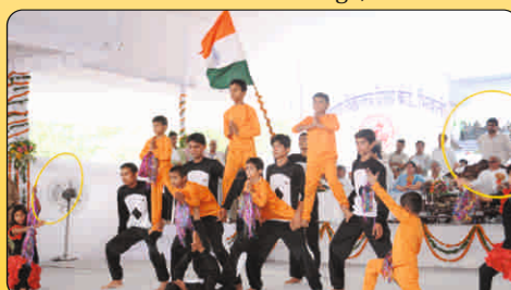
Students of SRS showcased their fine aerobic skills via their goose bumps raising presentation