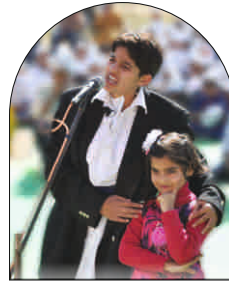
Nukkad natak at Gurgaon