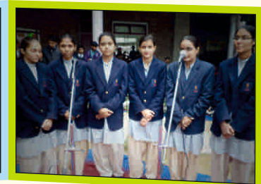
Students singing carols on the eve of Christmas