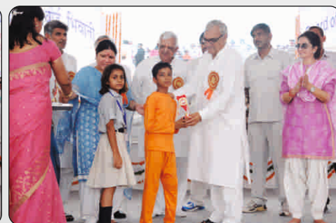
Stars of SRS getting awards from honourable C.M. Haryana, Mr. Bhupender Singh Hooda