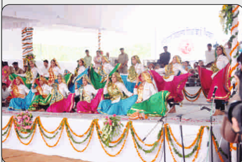
Saaman Ki Ruth Aayi, Re Dekho Samman ki Ruth Aayi .....

Participants of various events sharing their place on the stage along with the esteemed guests to get captured by the roving eye of the camera