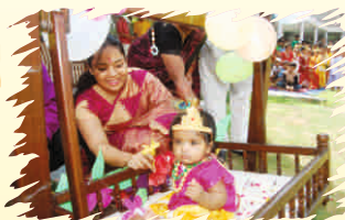
Laddu Gopal with the guest