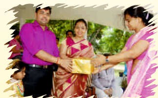
Worthy guests being honoured